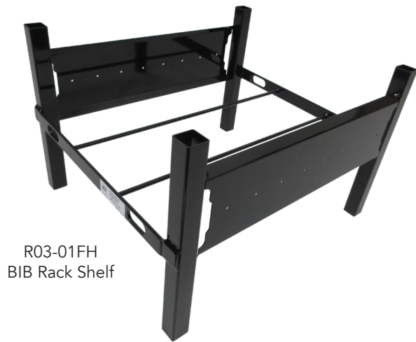
R03-01FH BIB Rack Shelf