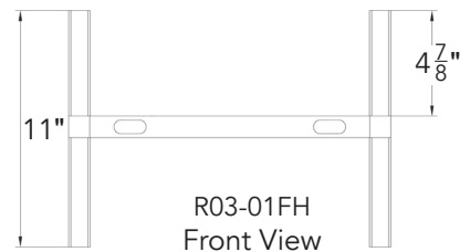
R03-01FH Front View